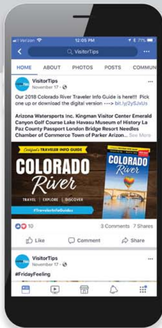
VisitorTips Facebook Example

We have initiated a social media push of our Traveler Info Guides and other publications on Facebook, Twitter and Instagram. These VisitorTips posts will create greater exposure of our Certified publications and products. Follow us and you can help raise the awareness of these social media posts, and promote our publications through our extensive digital exposure. Let's work together to create an impactful Social Media Buzz!