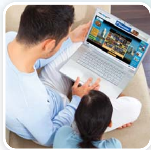
From their Computer

Now...Travelers can access your Brochure ANYWHERE, ANYTIME!