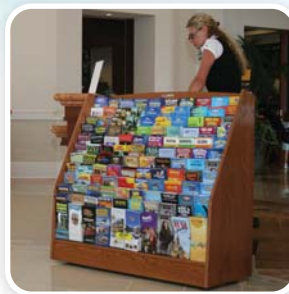
From Brochure Racks