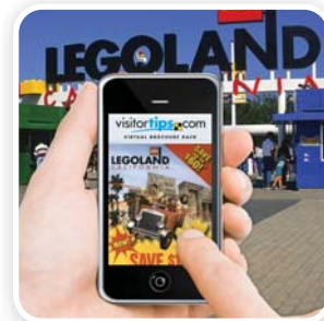
From their Mobile Devices

CERTIFIED FOLDER DISPLAY SERVICE, INC. SINCE 1990