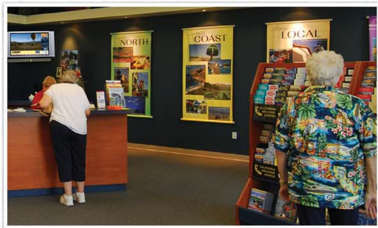
Interior of California Welcome Center Oxnard